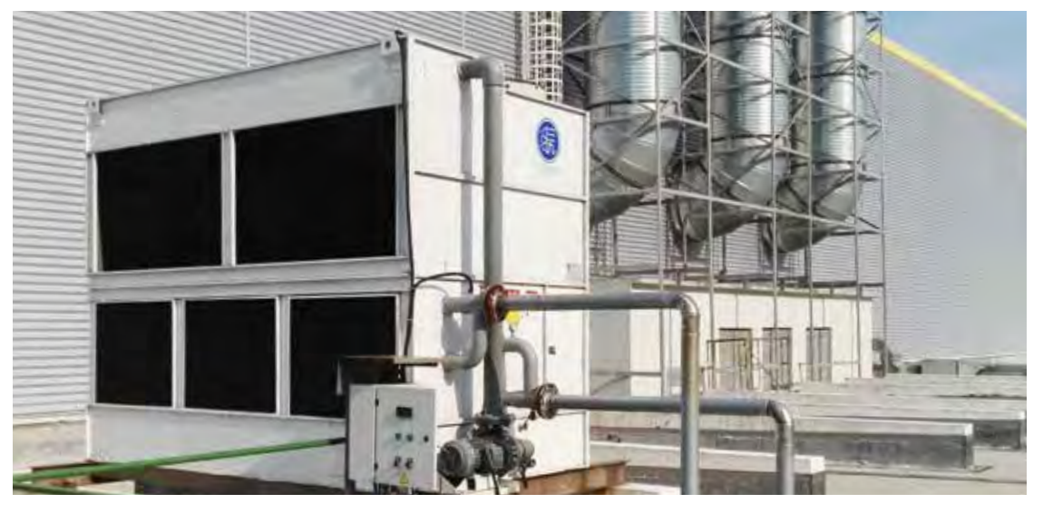
For Xinjiang Baomo Petrochemical