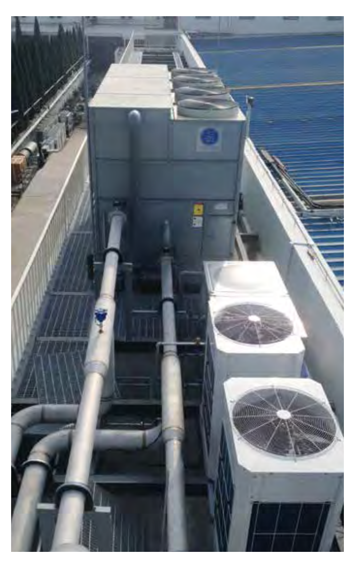
For YORK A/C