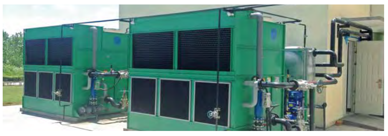
• For Zhiguang Electric