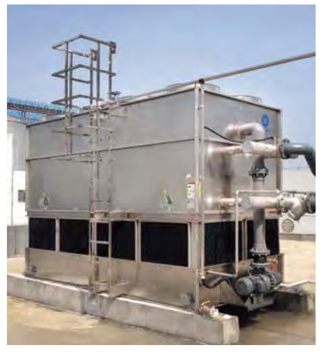
For Tsingtao Brewaery

Data Centers, Frequency Converters, Injection Machines, Printing Lines, Drawbenches, Polycrystalline Furnaces, etc.