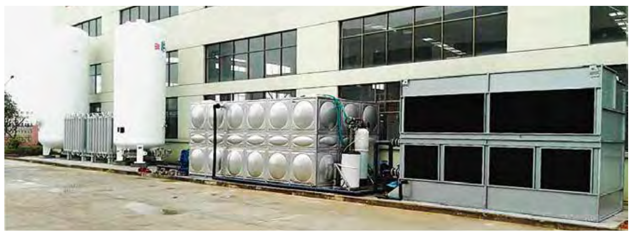
For Jinfei Holding Group