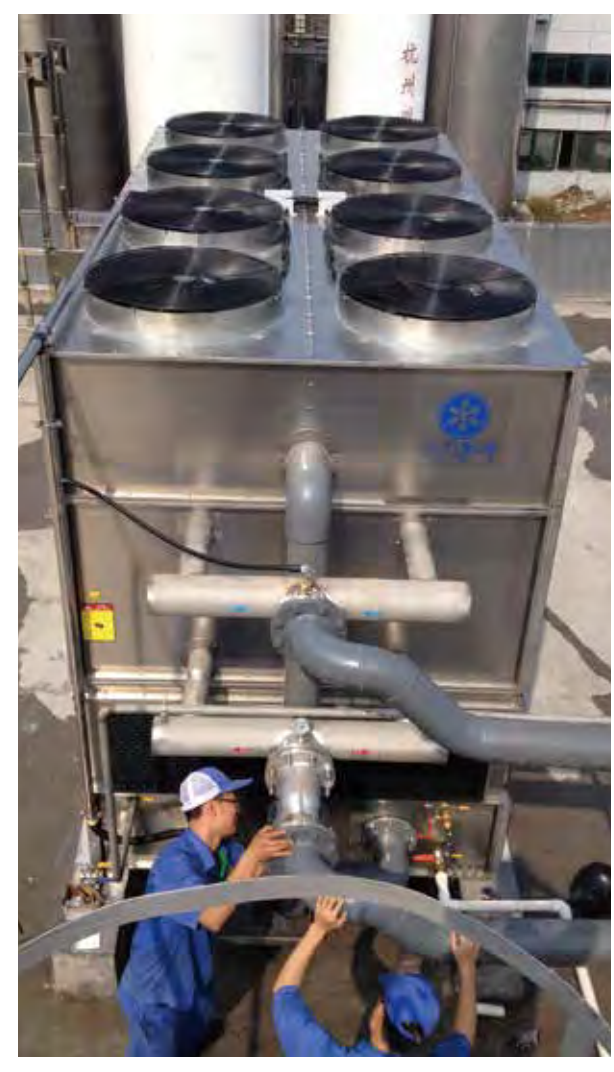
For Tsingtao Brewaery